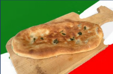
...at its best.. Vladi-made focaccia