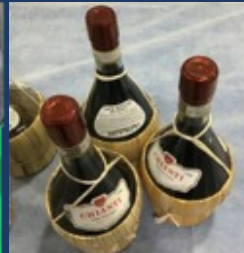
red wine: Chianti כשר