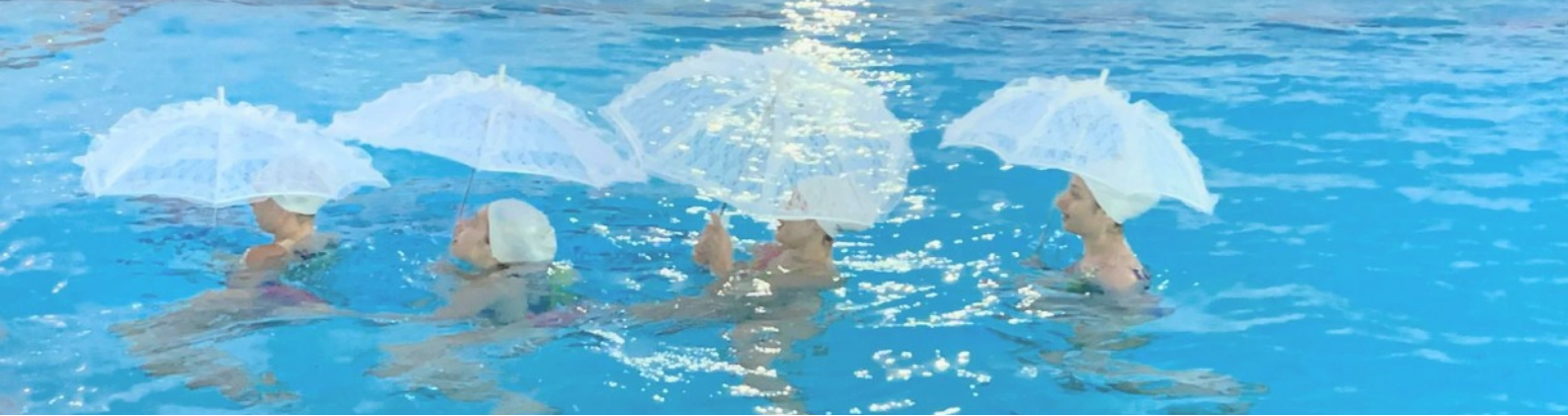
A group of young synchro swimmers performed at the “Italian Night”, the first outdoor Pool party