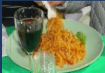
... and spaghetti al dente