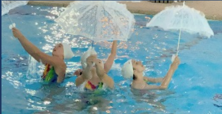
Opening: synchro Swimming

The Italian Evening at the Pool: all seats had been booked within a few hours.