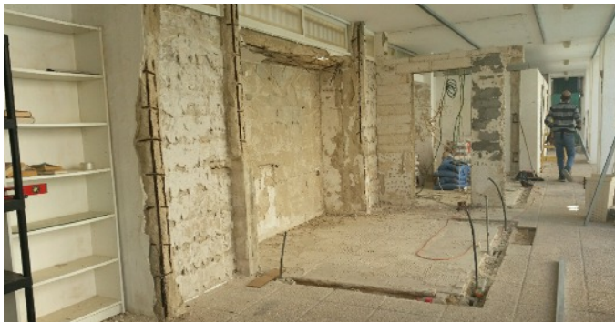
The future Pool lounge area