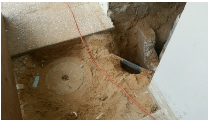
Surprise, surprise: Yossi discovered a hidden water pipe junction