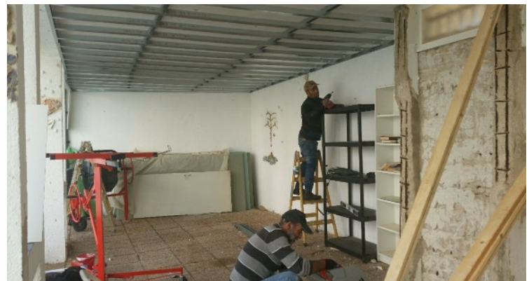
Laying bars for a dropped ceiling...