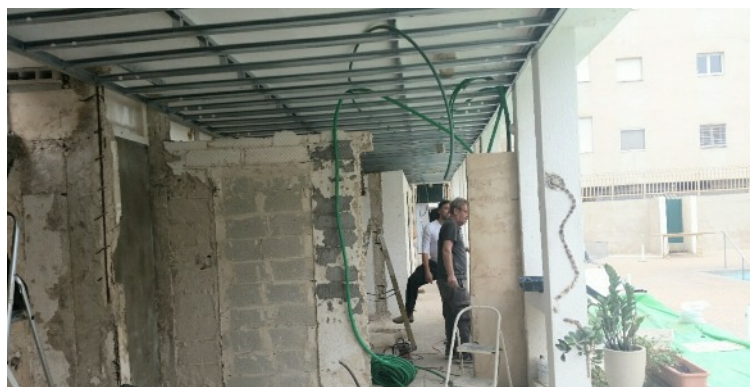
...to hide all electrical cables