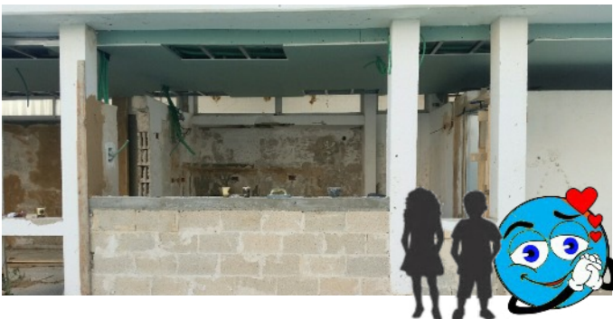
Shape of the kitchen bar with a lower children's bar on the right