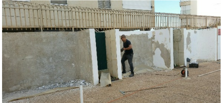
Westside wall: cleaning and repairing the walls for painting future covered storage facilities for sunlounges