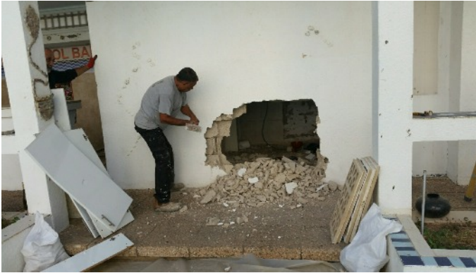
Start for a new kitchen with a better view around the Pool