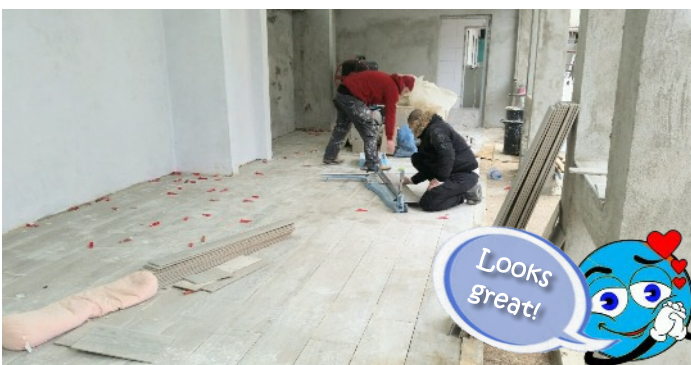
Non-slippery ceramic tiles were laid in the Pool lounge area and the kitchen.

There are 4 areas we had to choose tiles for: 1. the enlarged Pool Lounge area with the table tennis table