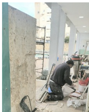
Enhancing the Pool entrance area