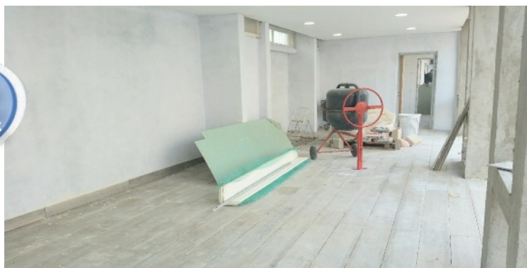
The new Pool Lounge: quite an impressive size and future area for the Pool's entertainment programme...more details on page 4