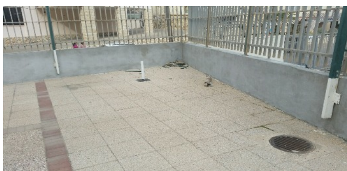
...inside and on the outside wall facing the parking lot - a joint project with the Vaad Habayit.