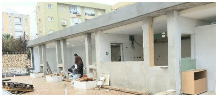
The basic structure for the new open kitchen with an adult and a children bar is finished...

The management has almost finalised all details. In the next few weeks we shall inform the shareholders how to apply the system .