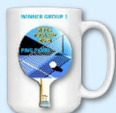
2nd Table Tennis Tournament