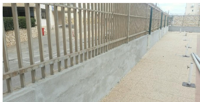
All the walls underneath the new panels had to be repaired and fortified...