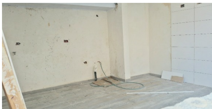
...the equipment and decoration, realised by a specialised carpenter