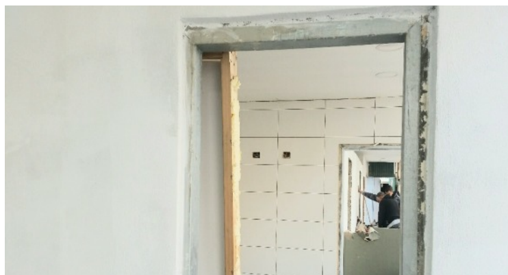
...including the tiling. Next steps: doors on each side and...