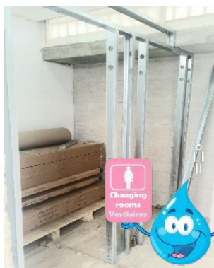
2 changing rooms in each WC for men and women