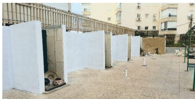
Preparatory works for 4 storage units